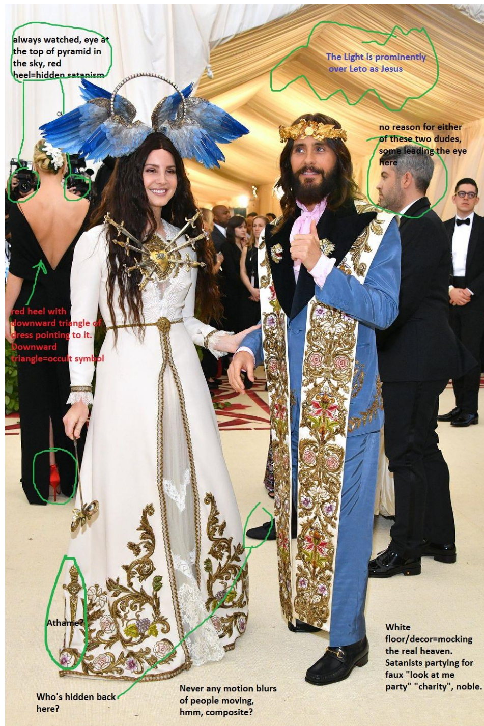
Figure 3 LDR and Actor(scary) Jared Leto at the Met Gala 2018 in blasphemous Mary and Jesus costumes. The theme of the gala was Catholic priest fashions and the whole cadre of satanists was there. LDR calls herself a Catholic with her crosses etc but it's really all about subversion from within for these sick people. Bad Catholics do more damage to Catholicism than all the outsiders combined. Photo actually is a story with precisely placed background and objects just like all modern publicity photos. Body postures and gestures are precise too. Watch where the lines in the carpet lead the eye to, Leto's crotch.

require the use of an alter to lock it away or the whole system of alters and personailites would